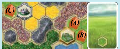
The player builds settlements A and B next to a location space on the appropriate terrain, then uses the outpost to build settlement C next to a nomad space.

This settlement must still be built on the appropriate terrain type for your mandatory action or the specific extra action.