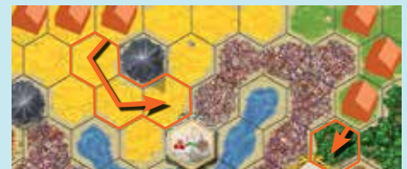
The player moves one of her settlements 3 spaces, then claims the nomad tile next to its new location. Then she moves another settlement 1 space next to a location space.

You may perform this extra action either before or after your mandatory action.