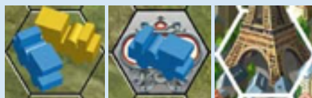
rural hex city hex Eiffel tower hex