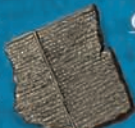
Gilgamesh Epos 12th century BC tablet II, Ninive version