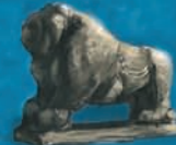
Babylonian Lion circa 1300 BC