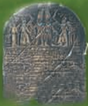
Stele circa 1200 BC Merneptah Stele