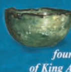
Glass bowl of Nimrud 8th century BC found in the palace of King Ashurnasirpal II