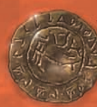
City seal of Troy Found in 1873 by Heinrich Schliemann