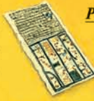
Papyrus of Abusir circa 2360 BC parts found in 1893 in Abusir