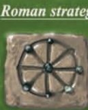
Roman strategy board game circa 50 BC