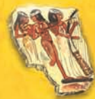
Grave of Pepinakht 1425 BC Thebes, excavated 1889