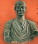
Charioteer of Delphi 478 – 474 BC bronze statue