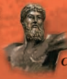
Zeus statue 460 BC found in 1926 in the sea at Cape Artemision