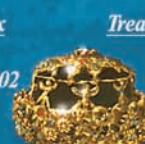
Treasure of Nimrud 9th century BC found in 1988 in palace of Nimrud