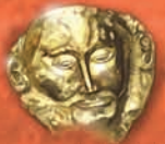
Mask of Agamemnon 1500 BC found in 1876 by Heinrich Schliemann