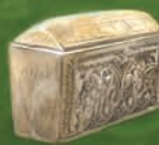
Ossuary 1st century casket