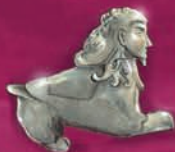
Sphinx Sphinx statue from Malia