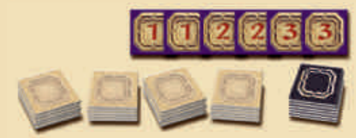
The stacks with the bonus-chips give an overview of which round is currently being played since 1 stack is distributed in each round.