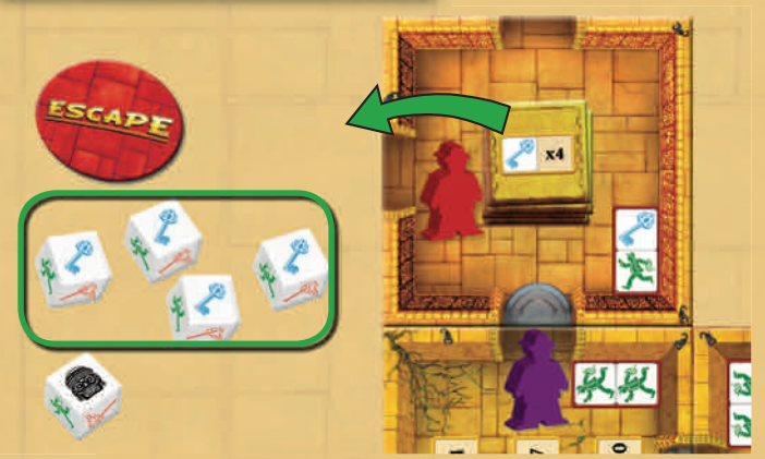
Micha rolls the icons needed and removes the top tile.

Once this chamber is discovered, the players stack 4 of the 6 task tiles face down inside this chamber. When an adventurer first enters this chamber, he reveals the top tile. Each tile shows a distinctive combination of icons that must be rolled by one or more adventurers who are inside this chamber. As soon as these icons have been rolled, remove that tile from the game and reveal the next one. After all 4 task tiles have been removed from the game, this task is complete.