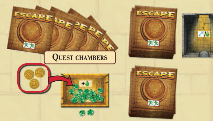
The adventurers have agreed to use 3 quest chambers, thus they place 3 quest markers on the gem depot.

Next, place as many quest markers on the gem depot as the number of quest chambers in the game. Shuffle the task tiles face down, then place them next to the gem depot, along with the ghost and the 3 gem tiles. Proceed with the set-up as normal.