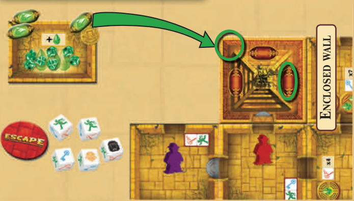
Micha discovers the obelisk chamber and places it adjacent to one wall already. He places the quest marker and 1 gem tile inside the obelisk chamber.

Note: The adventurers cannot enter the obelisk chamber. They cannot remove gem tiles by activating magic gems, but only by enclosing the obelisk chamber with other chambers.