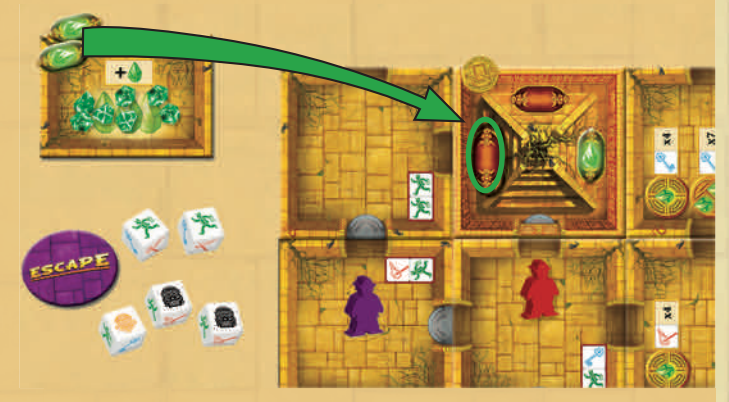
Ani places another chamber next to the obelisk chamber and moves one more gem tile to the chamber.