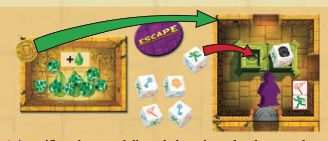
Ani sacrifices the second die and places it on the altar, together with a quest marker.