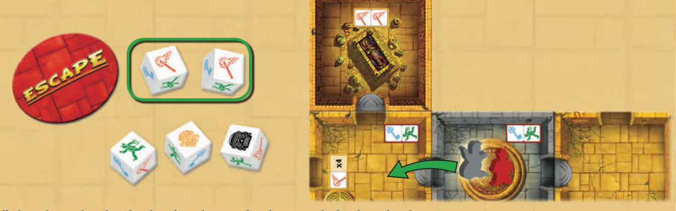
Micha rolls 2 torches and pushes the ghost into the next chamber, towards the ghost chamber.

Note: The adventurers cannot enter the ghost chamber.